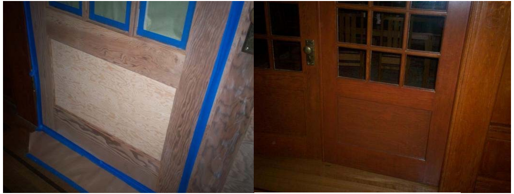
Before : painted woodwork stripped.

If you would like to restore or refinish any of your woodwork please contact us at 503-284-3167 for a consultation.