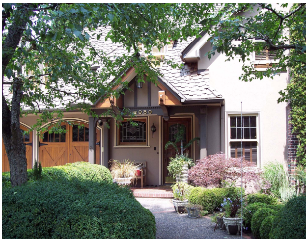
Your home can be a "gem" of the block if properly maintained with regular cleaning and painting.

Then as your neighbors take their evening walks they will stop and admire your home .